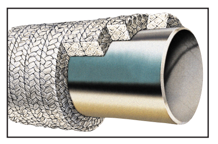
Solution : Chesterton 1730 Mill Pack is resistant to heat and abrasives, will not glaze, unlike common mill packings